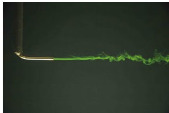
Figure 1. Short captions are centered.

All tables should be numbered consecutively and captioned; the caption should be 9 pt, and upper and lower case letters. It should be placed above the table and centered, if less than one line long, or fully justified if longer. The body of the table should be no smaller than 7 pt. The use of boldface and italics is encouraged to make necessary distinctions within the table. Nine point (9 pt.) leading is recommended.